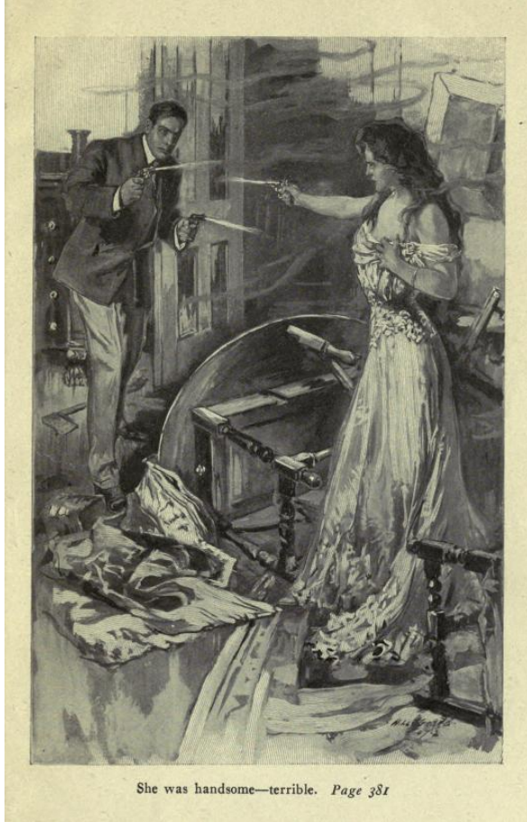
She was handsome—terrible. Page 381